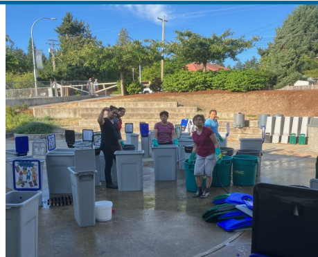
SDSS Custodians Summer Clean-up.