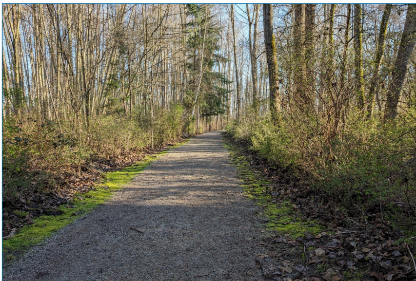
A favourite path at Deas Island Regional Park

(Note: It was the largest until early 2023, when a larger egg was constructed in Brazil.)