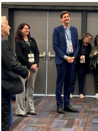
BC Premier David Eby in attendance at the BCFed convention.