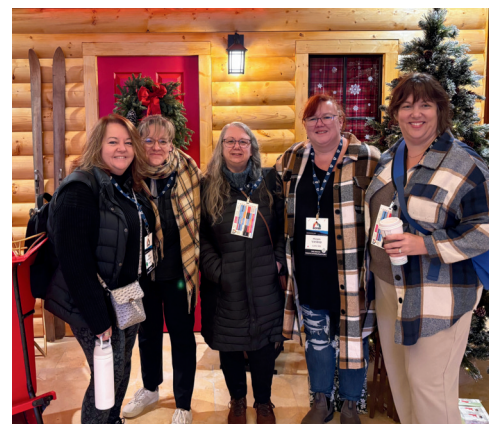
Last day of BCFed time to head home after a long and fantastic week being with labor workers all across BC. We networked, made new connections, new friends and old and came home with a wealth of important resolutions passed for the BCFed to work on.