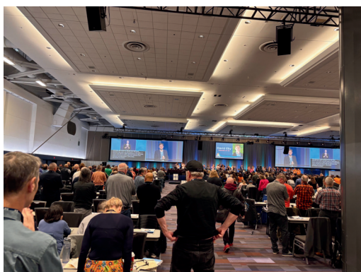
BC Federation of Labour standing moment of silence for the passing of John Horgan. He will be very missed. Thank you John for all you did for BC and the Labor workers.